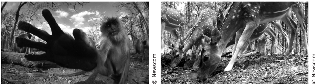
Real Images Captured by Elephant Cameras

(20) Clearly, the jungle animals were not afraid of the elephant cameras. (21) As a result, the elephants were able to film creatures that are often leery of people. (22) Curious monkeys reached out for the tusk-cams deer stood still and allowed the cameras to film them. (23) Jungle mothers let the elephants get very close to their babies.